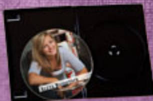
DVD SLIDESHOW DVD of your favorites set to music.