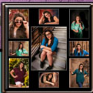
THE ALL U SQUARE 20" x 20" framed with choice of color.

Find us on Facebook search for: (countrywide photographers)