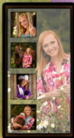
Face it! 15" x 30" framed with choice of color.