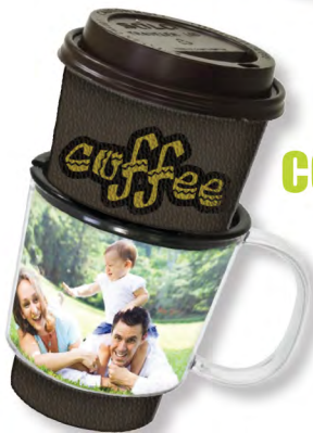
COFFEE SLEEVE $12