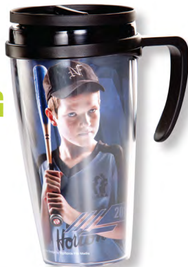
TRAVEL MUG $24