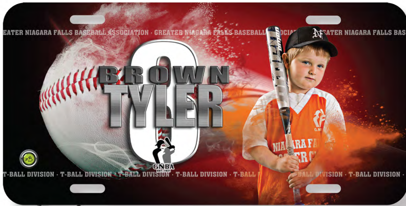
LICENSE PLATE $42