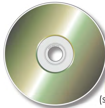
DIGITAL FILE (simple print) $40

Angie Humphrey owner . photographer . digital artist angie@mystudioniagara.com 905.354.3259 Tax I.D.# 815988464