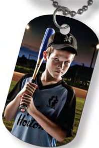
DOG TAG $20