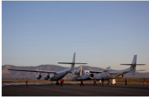
Flight preparations prior to the first powered flight of Virgin Galactic’s SpaceShipTwo in April.

Testing leading up to this flight has been successful thus far. The most recent milestone was on Sept. 5, when SS2’s second rocket-powered supersonic flight left the Mojave Air and Space Port and achieved its highest altitude (69,000 feet) and greatest speed (Mach 1.43) yet. Another achievement during that flight: the ship’s use of a high-altitude deployment “feathering” re-entry mechanism.