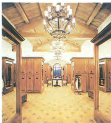
Top: A view of the 1st and 18th holes of the golf course from the Bridges' clubhouse. Above: Inside the club's striking men's locker room.

The Bridges at Rancho Santa Fe, 858.756.8700, www.thebridgesrfsf.com ; Marsh & Associates, 949.717.3077, www.mai-architects.com